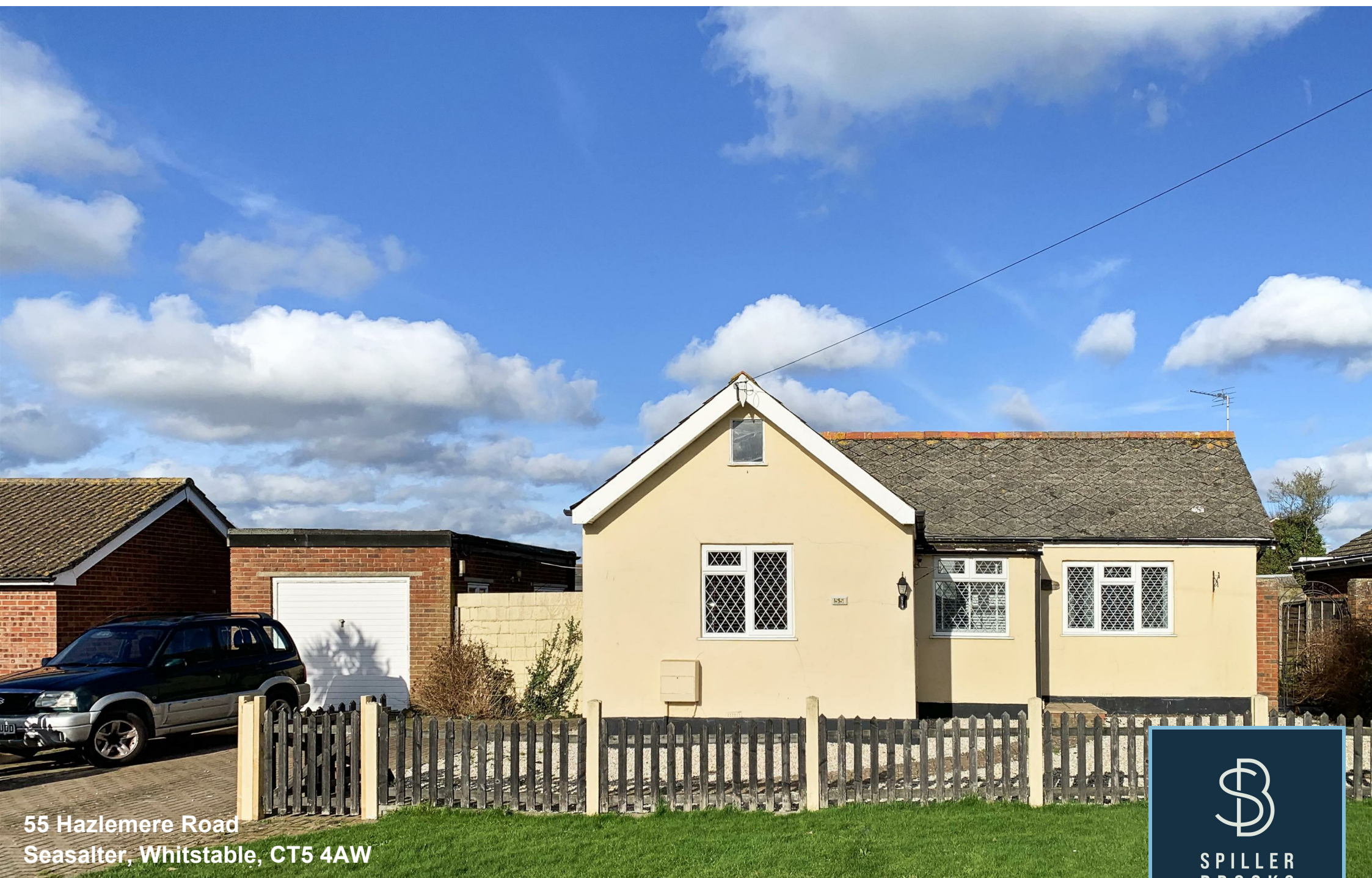
55 Hazlemere Road Seasalter, Whitstable, CT5 4AW